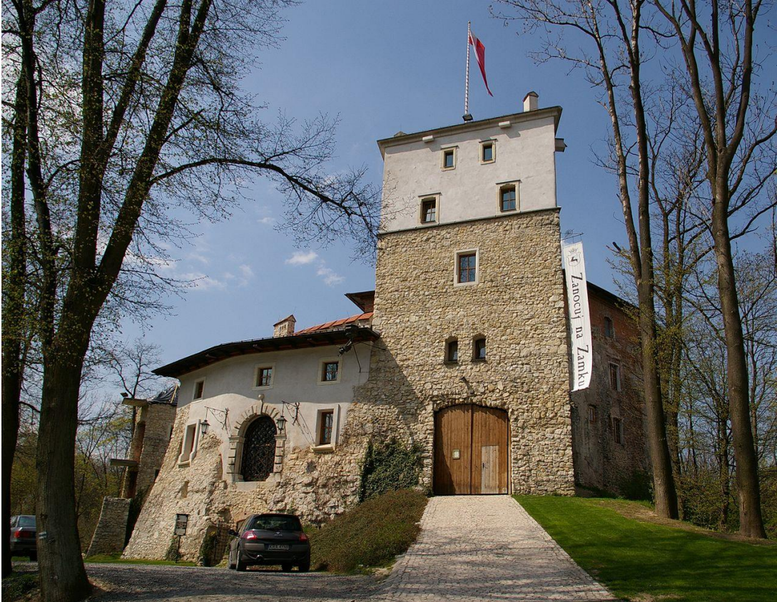
Castle Korzkiew as it is now