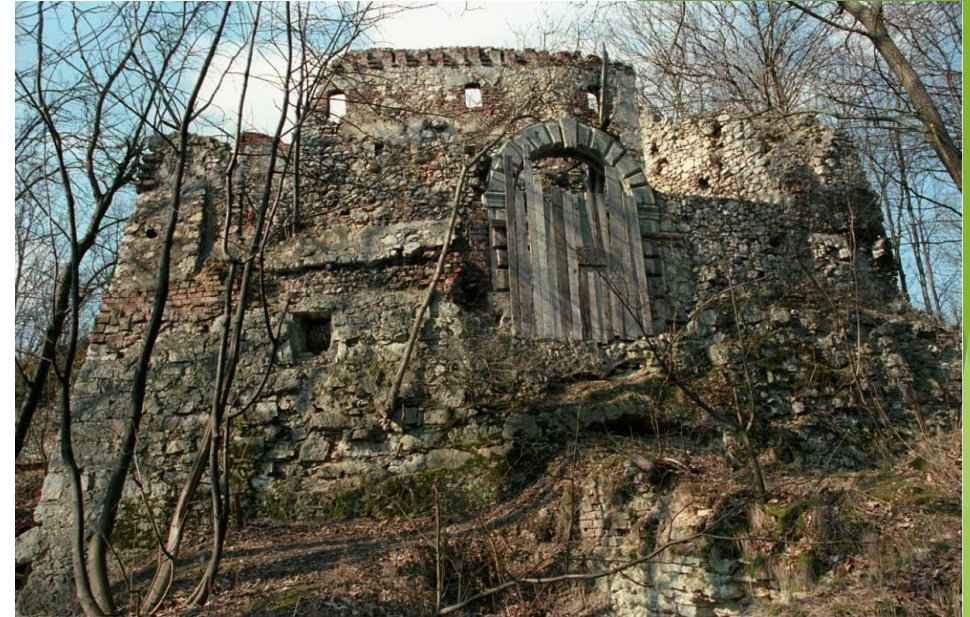
Castle Korzkiew before renovation